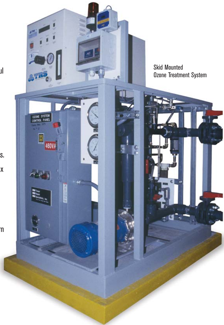
Skid Mounted Ozone Treatment System

TRS offers proven expertise in assessment, sizing, design, manufacturing and service of treatment systems.